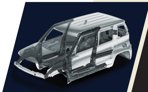
High strength steel body shell