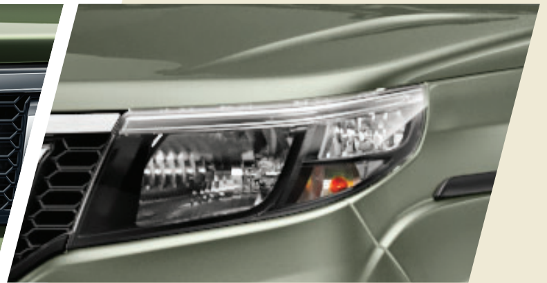
Sporty headlamps with DRLs