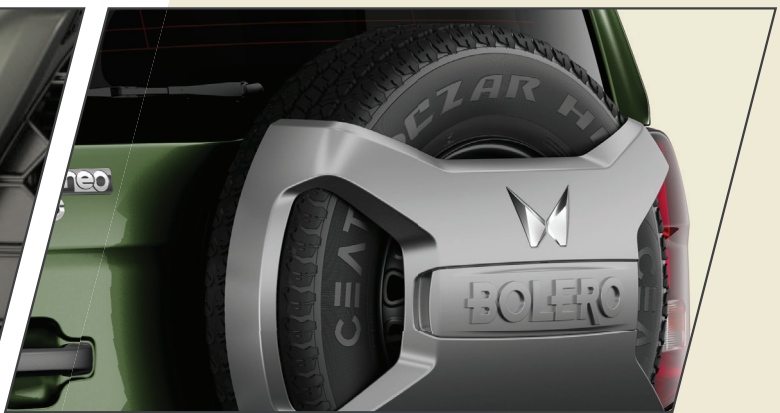
Signature Bolero branding on spare wheel cover