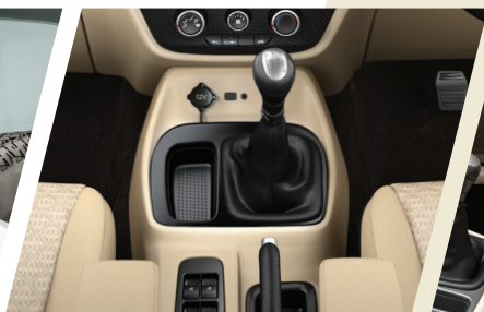
Premium center console