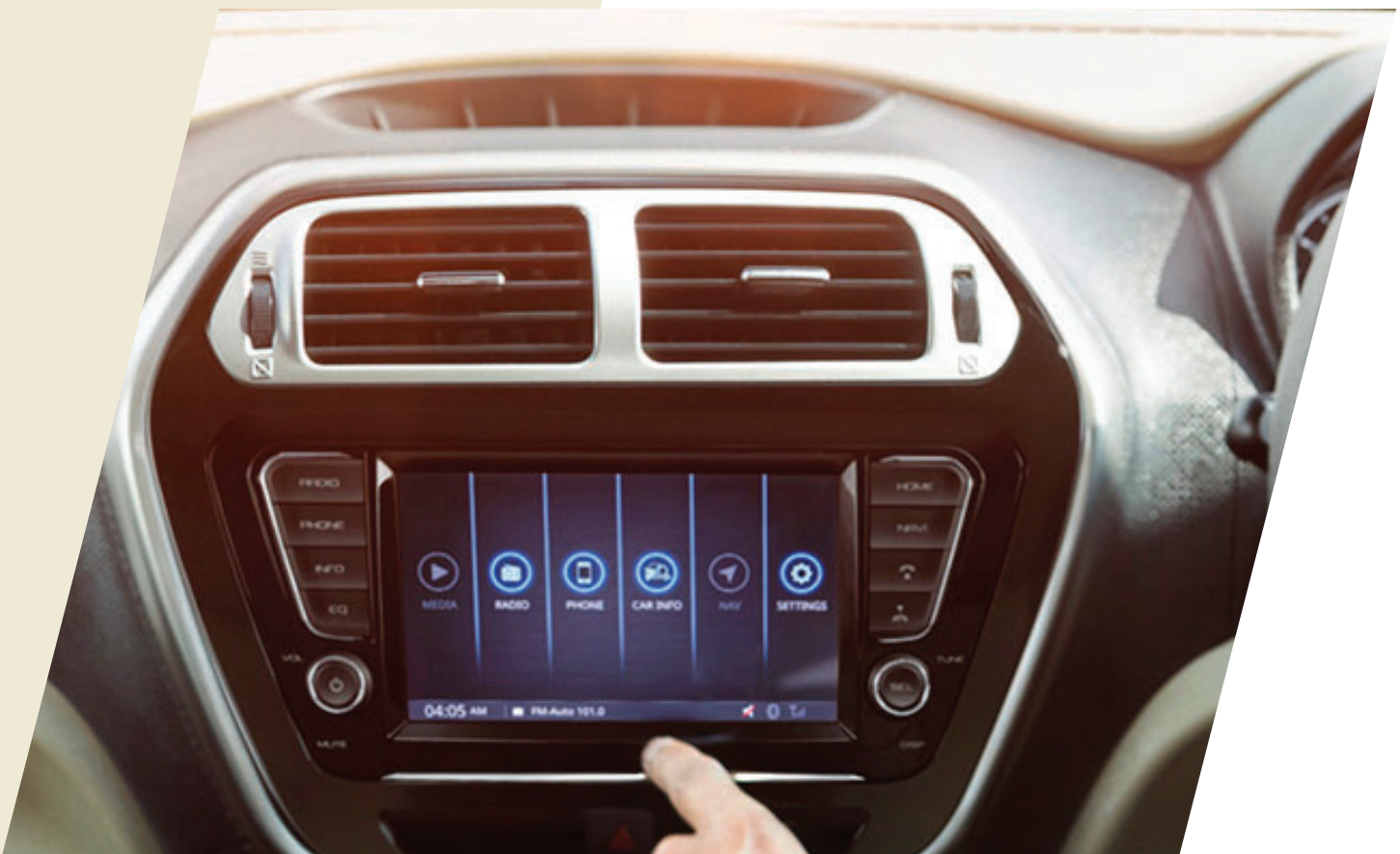
Advanced 17.8 cm touchscreen infotainment system