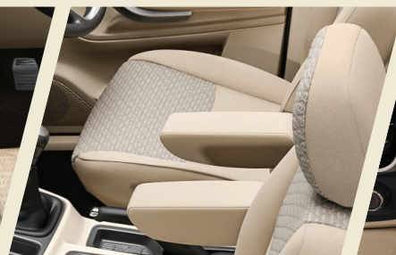
Armrests in the front and middle rows