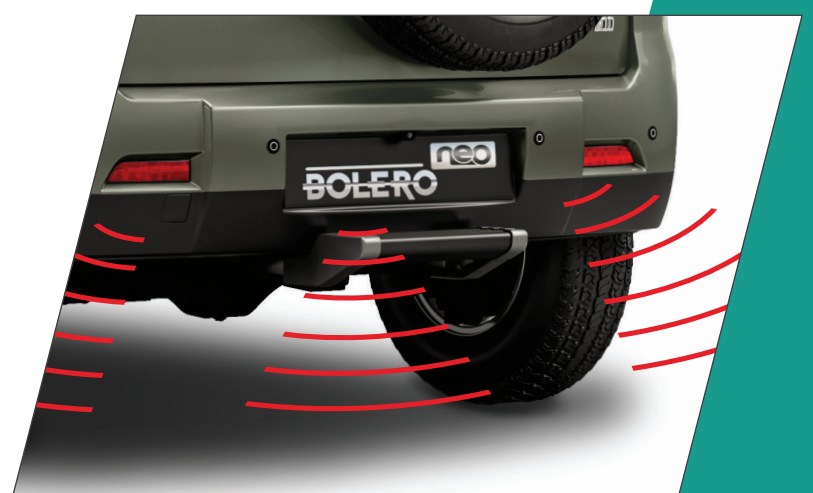
Intellipark reverse assist