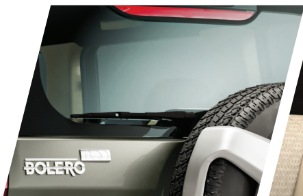
Rear wash and wipe with defogger