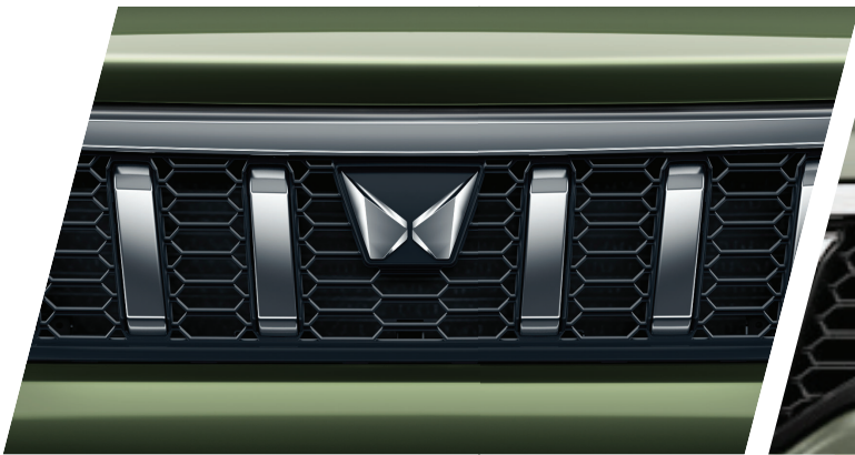
Bolero family grill with chrome inserts