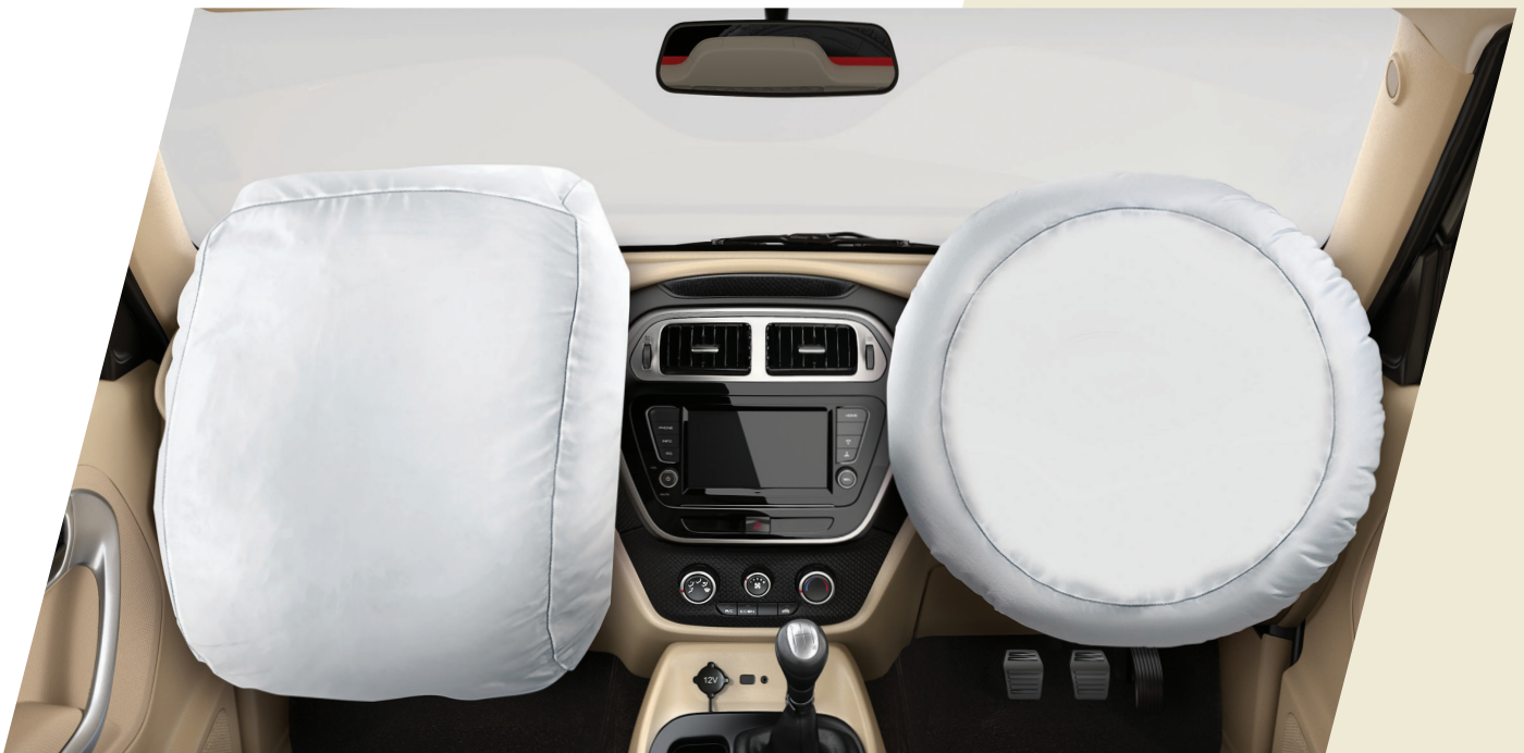
Dual airbags for driver and co-driver