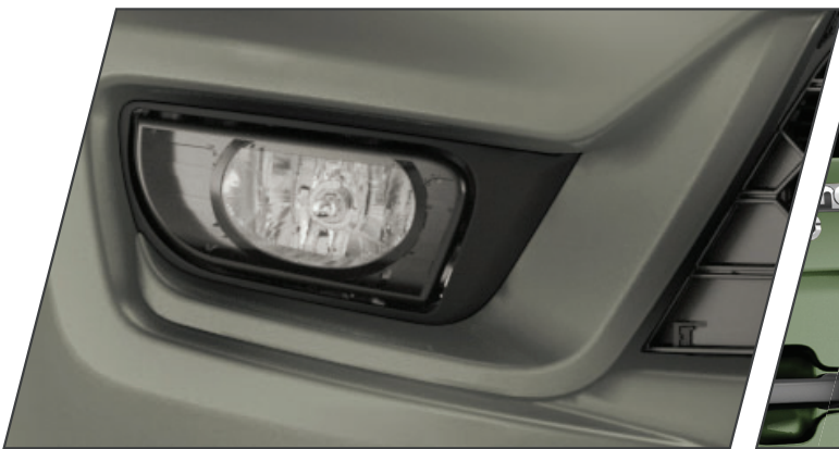
Stylish fog lamp