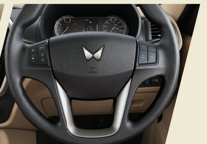
Tilt steering with mounted controls.