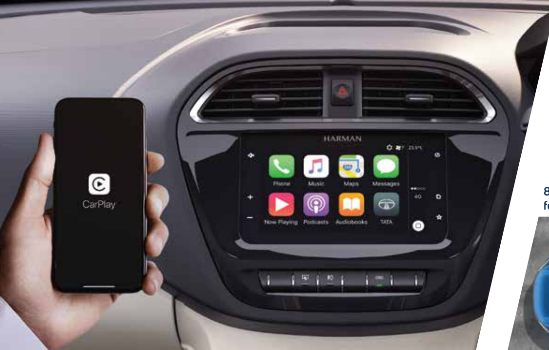
Apple Carplay™ and Android Auto™ Connectivity