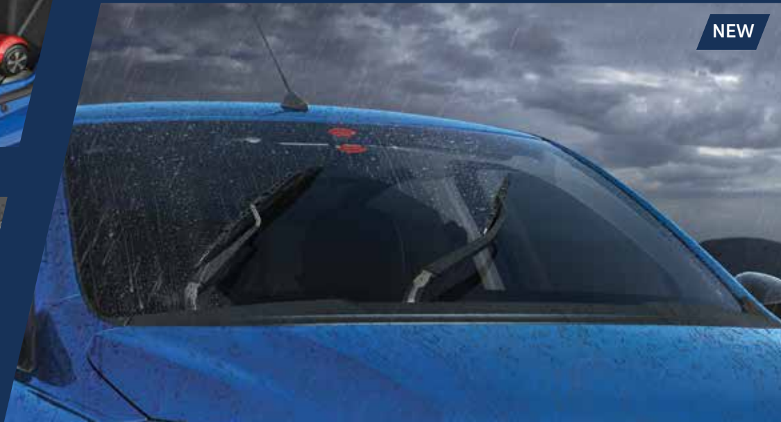
Rain Sensing Wipers