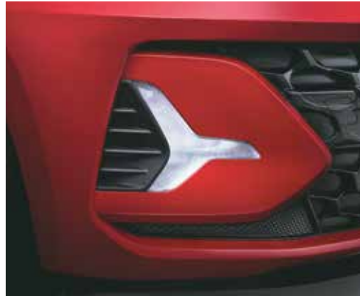
LED daytime running lamps (DRLs)