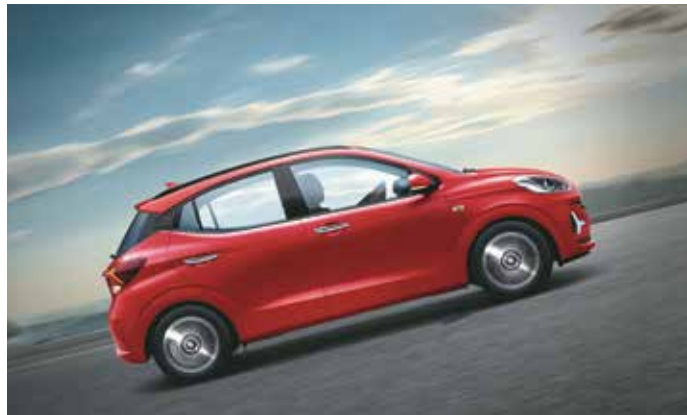
Hill-start assist control (HAC)