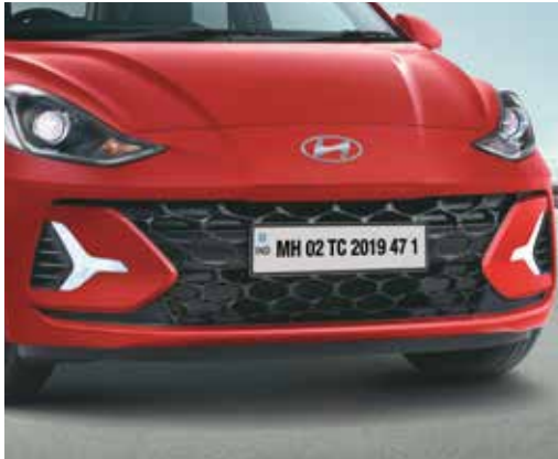
Painted black radiator grille

Style meets sophistication in the new Grand i10 NIOS. The new painted black radiator grille and LED daytime running lamps (DRLs) give it that refreshing new look. The new R15 (D=380.2 mm) diamond cut alloy wheels project an agile stance. And the new tail gate design with LED tail lamps defines its sharp rear profile, giving the new Grand i10 NIOS an unmistakably unique identity.