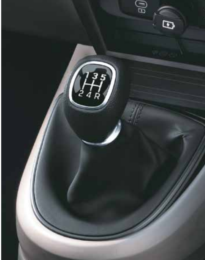
Manual transmission (MT)