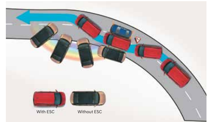
Electronic stability control (ESC) Vehicle stability management (VSM)