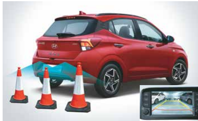
Rear parking camera with display on audio