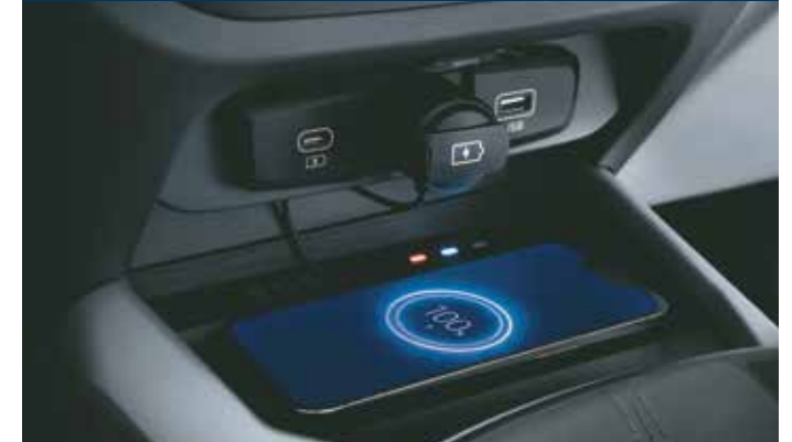
Wireless phone charger*