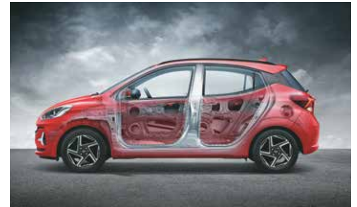
Strong built structure

Other features: Child seat anchor (ISOFIX) (New) | Driver rear view monitor (DRVM) (Best in segment) | Speed alert system | Front seatbelt pretensioner with load limiters | Burglar alarm (New) | Rear defogger | Impact sensing auto door unlock | Speed sensing auto door lock | Headlamp escort system | Emergency stop signal (1 st in segment)