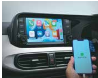
Apple CarPlay and Android Auto