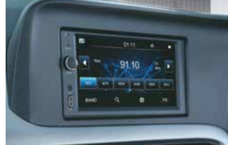
17.14cm (6.75") touchscreen display audio

Other features: 3 Point seat belts (All seats) (Best in segment) | Seat belt reminder (All seats) (Best in segment) | Headlamp escort system Burglar alarm | TPMS - highline | 6 Airbags