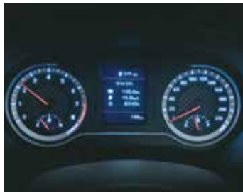
8.89 cm (3.5") speedometer with multi info display