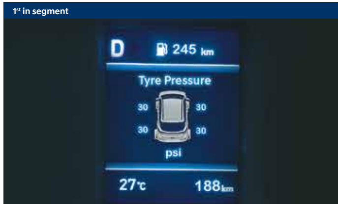
Tyre pressure monitoring system (TPMS) - highline