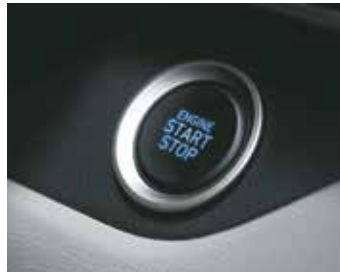
Smart key with push button start/stop