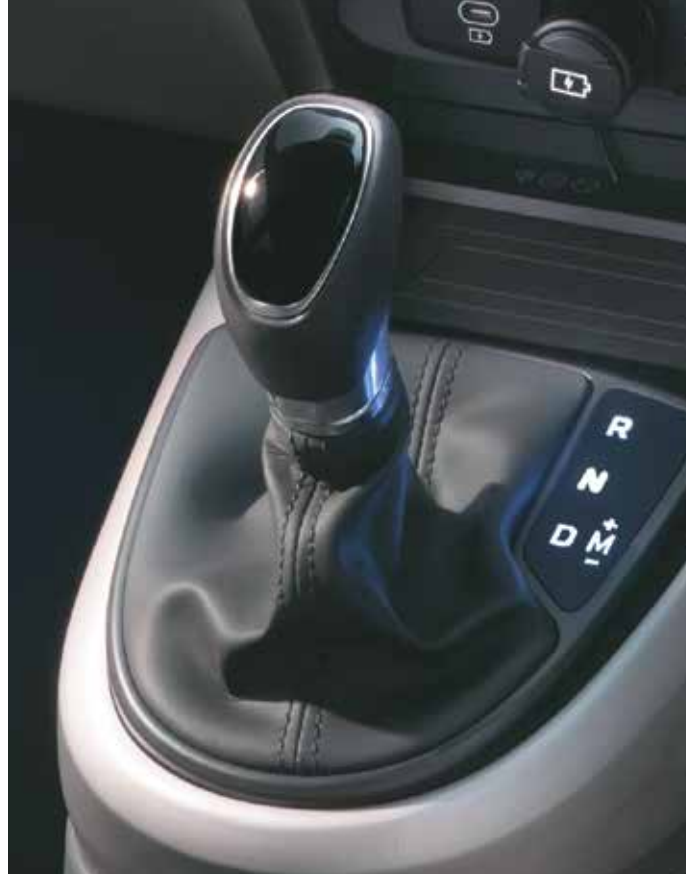
Automated manual transmission (AMT)