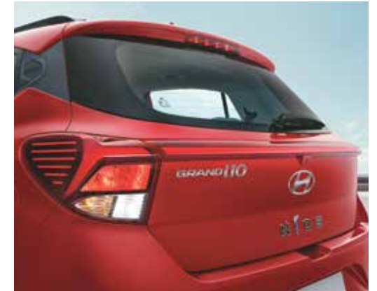
LED tail lamps