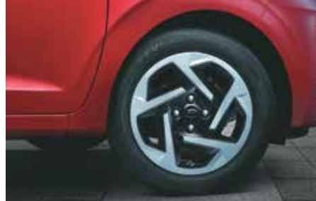
R15 (D = 380.2mm) Dual tone styled steel wheel