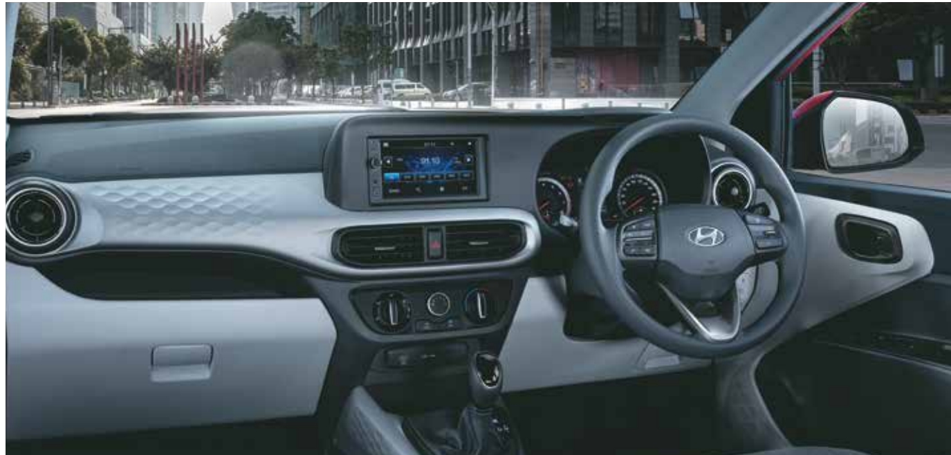
Dual tone grey interiors

Take control of your commute with the Grand i10 Nios corporate trim. Meticulously crafted to enhance your drive while exuding an executive presence. Experience the seamless convergence of technology and design that features a monochromatic black interior punctuated by strategically placed red accents, and gleaming chrome details.