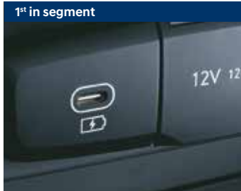
Fast USB charger (Type C)