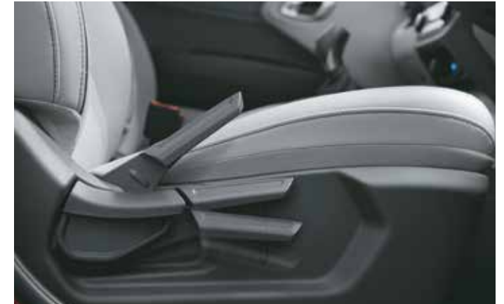
Driver seat height adjuster

Other features: Tilt steering | Adjustable rear headrest | Cooled glove box (1 st in segment)