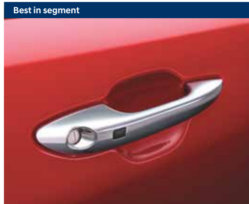
Chrome outside door handles