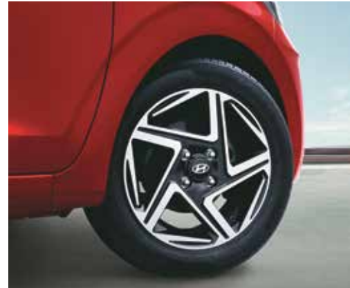
R15 (D=380.2 mm) diamond cut alloy wheels