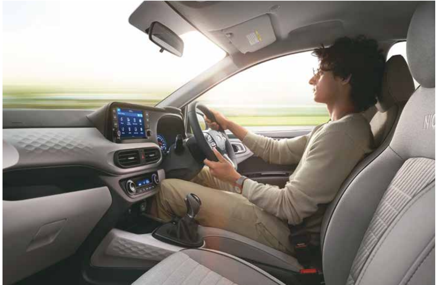
Dual tone grey interior

Other features: Steering mounted audio & bluetooth controls