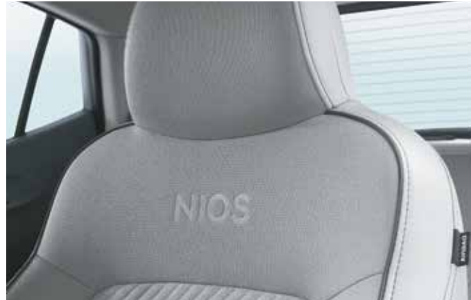
Semi fabric seat with piping