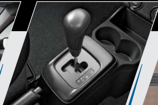
AUTO GEAR SHIFT TECHNOLOGY