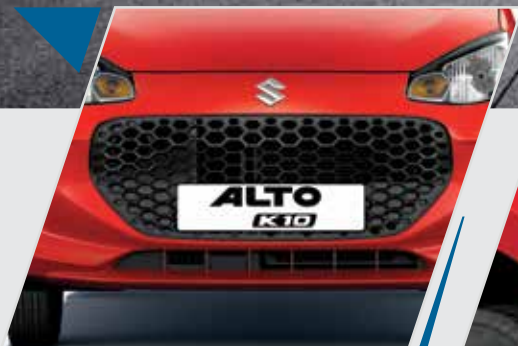
YOUTHFUL CONTEMPORARY DESIGN WITH HONEYCOMB GRILLE

Now experience the feeling of accomplishment with a special companion, the all-new Alto K10. It offers remarkable looks with a great combo of style and modernity.