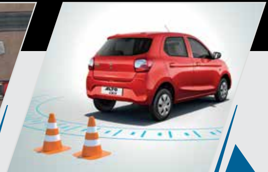
REVERSE PARKING SENSORS