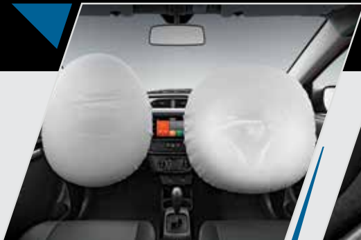
15+ SAFETY FEATURES INCLUDING DUAL AIRBAGS**

NEXT GEN K-SERIES 1.0L DUAL JET, DUAL VVT ENGINE