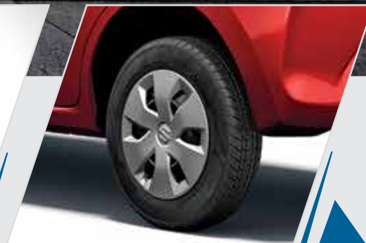
145/80 R13 TYRES WITH HONEYCOMB WHEEL COVERS