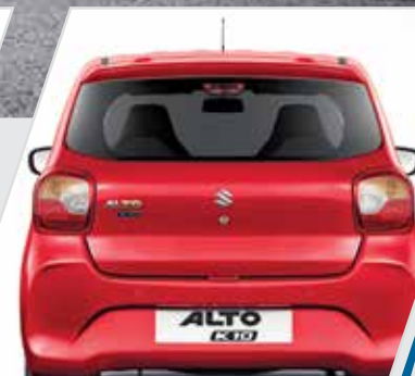
TRENDY REAR COMBINATION LAMPS