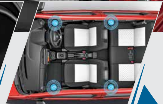
1 st IN SEGMENT 4 SPEAKERS