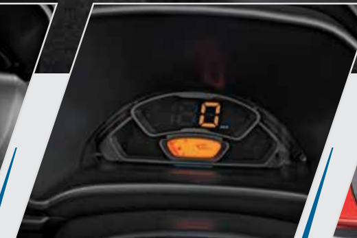
SPEEDO METER WITH EXCITING DIGITAL SPEED DISPLAY