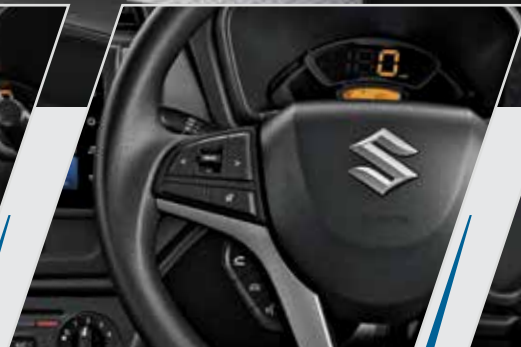
STEERING MOUNTED AUDIO AND VOICE CONTROL