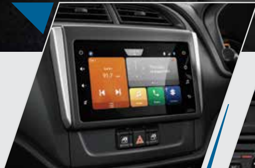
SMARTPLAY STUDIO WITH SMARTPHONE NAVIGATION

The all-new Alto K10 comes with modern interiors with updated technology, a perfect blend of comfort and practicality.